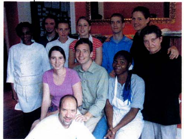
Part of the Columbia Café team.