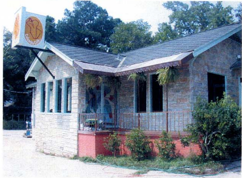
Columbia Café — Northwest corner of Kings Highway and Creswell Avenue